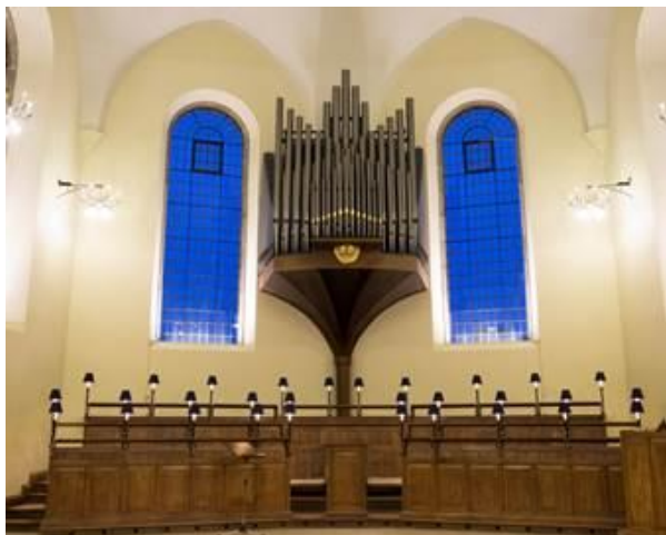
The Cousans organ

As part of Comper's work to extend the Cathedral eastwards in the late 1960s, choir stalls were positioned at the East end of the Cathedral in the new Retrochoir. The Compton Organ – now on the opposite side of the Cathedral to the choir – was no longer suitable for choral accompaniment, and a modest 2-manual swallow's-nest organ by Cousans of Lincoln was placed above the new Retrochoir stalls. As a result of the age of some of the components