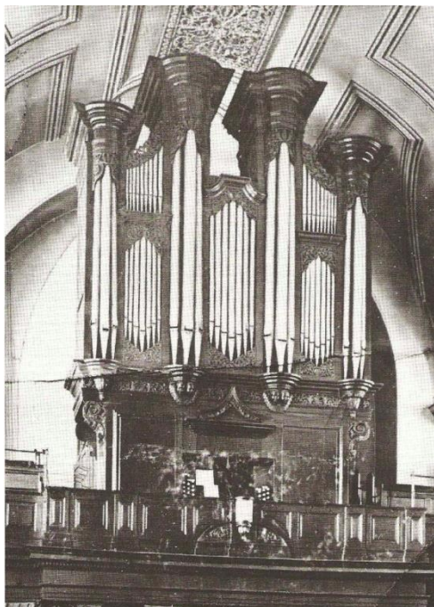
The eighteenth-century organ case