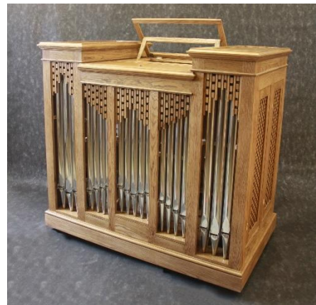
The Stow Memorial Organ