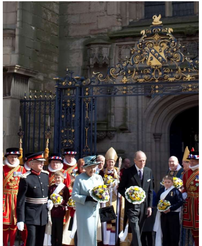
The Queen at Derby Cathedral in 2010

Prayers will be said this evening, Friday 9 th September at 5.30pm in Derby Cathedral to mourn the death of Queen Elizabeth II which was announced on Thursday 8 th September 2022. The Cathedral will be open until 7.00pm today and will remain open from 8.00am until 7.00pm this coming week for mourners to light candles and sign a Book of Condolence. People are welcome to bring floral tributes to the Cathedral. A special Civic Thanksgiving Service and also a Service of Reflection will be held during the mourning period, and further details will be announced in the coming days.